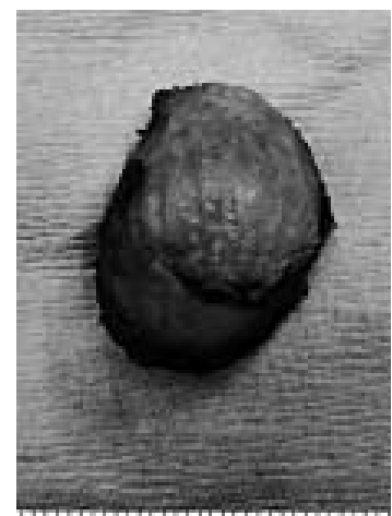
Fig. 2. Gross examination of the excised tumour showing a 2.5 × 2.0 cm capsulated, smooth and tender nodule.