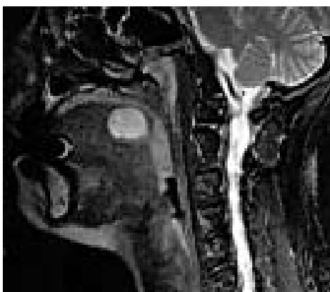
Fig. 1. Parasagittal T2-weighted MRI showing a well-delimited nodule with a heterogeneous high signal.