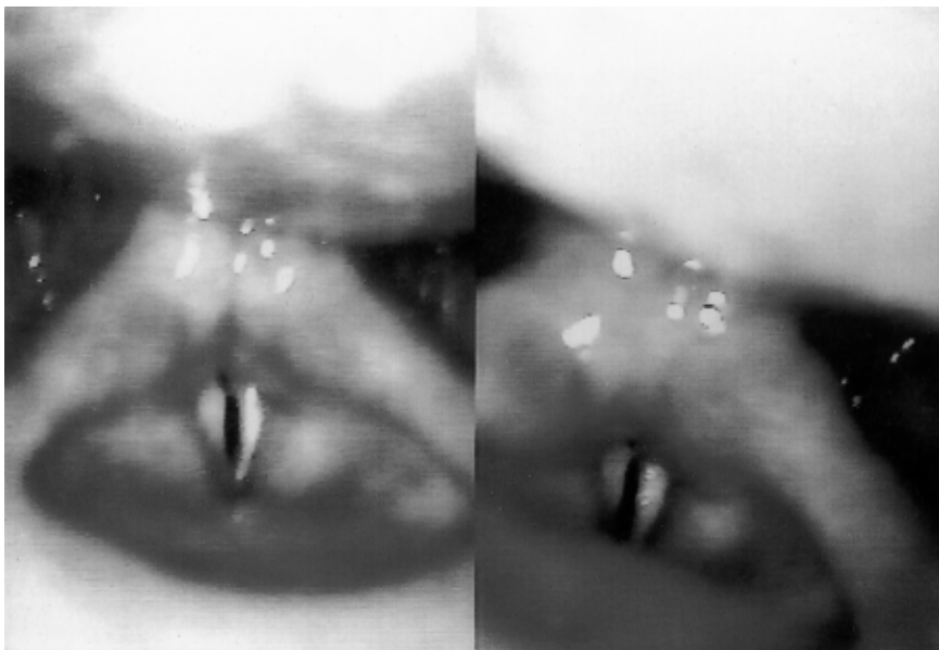
Fig. 2. Videostroboscopic views: a. 8 th month of treatment (left), b. 2 months after treatment (right).